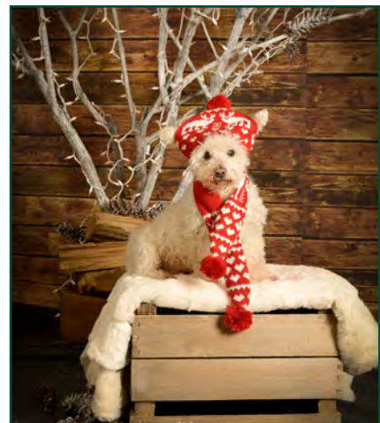
P.S. Our foster dog Pete is available for adoption.