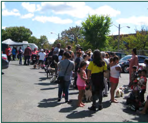
Several hundred people waited in line for hours for vaccines for their pets

Animal Alliance partnered with St. Hubert's Animal Welfare Center & Trenton Humane Law Enforcement to have two free vaccine clinics in underserved neighborhoods in nearby Trenton, NJ. Over 250 pet owners came to each clinic to receive vaccines and were given vouchers for free spay/neuter at Animal Alliance's Planned Pethood Low Cost Spay/Neuter Clinic. Animal Alliance and St. Hubert's split the cost of the surgeries and all other costs of this community outreach endeavor. For pet owners that did not have transportation, Animal Alliance volunteers stepped up and drove those pets to the clinic for surgery, and then returned them home. We were able to make a significant dent in animal overpopulation in the city of Trenton by spaying/neutering 52 animals, many of whom had previous litters.