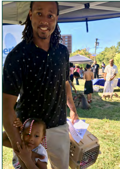
Underserved areas in Trenton are without nearby traditional veterinary care options

This family had 8 (!) unaltered pets spayed/neutered at Animal Alliance using vouchers from a vaccine clinic. These dogs had numerous litters and there was no end in sight — but now all are “fixed” and no more unwanted puppies!